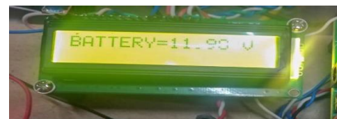
Fig 3. Battery status

In off condition, the battery terminals of vehicle must have 12 to 12.5 volts. The voltage of the terminals will range from 13 to 15 volts, when the engine is on. Caution is issued when the voltage values falls less than those indicated above. The battery status in on condition is shown in Fig 3. The system advises the driver to switch off the engine.