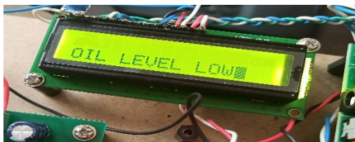
Fig 4. Low oil level indication