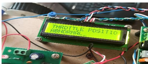
Fig 5. Abnormal throttle position indication

Throttle position sensor ADXL337 is used to monitor the vehicle's throttle for traction monitoring. On abnormal position of the throttle, warning is generated as indicated in Fig 5 and the system recommends the driver to turn off the vehicle.