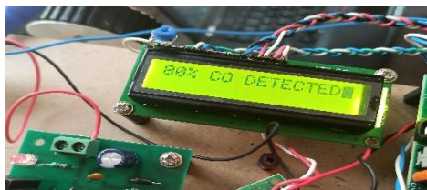
Fig 6. Exhaust gas indication

Gas sensor MQ2 is used to estimate the content of exhaust gas emitted by vehicle in parts per million. On an event, LCD shows 80% of maximum exhaust gas allowable as it is shown in Fig 6.