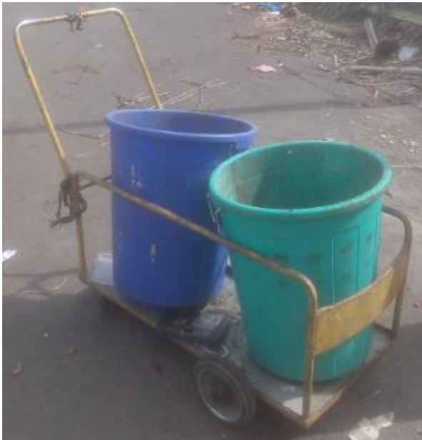
Fig 2. Easy wheel system for waste collection

This is very important and necessary challenge throughout the world, as there is rapid increase of population. So, an efficient and smart garbage system is required to the urban societies [5],[6].