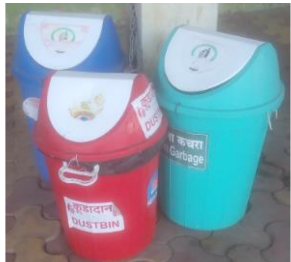
Fig 1. Green, Red and Blue Bins

If proper cleaning of waste material from the dustbin is done, it can be prevent serious diseases. At the same time there is a reduction of bad smell and also from unhygienic situation of the surroundings. Smart environment also gives smart valuation of the area. Organized and smart mechanism is highly recommended to all cities for proper waste management. The awareness to provide through local organization and NGO to rural areas are important to make surrounding clean.