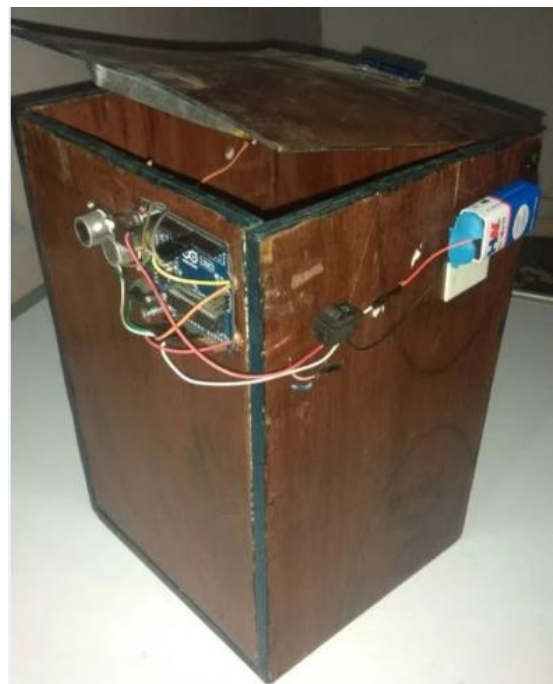
Fig 6. Prototype model for smart dustbin.

Servomotor and ultrasonic sensor are connected to respective pins of Arduino. When someone's hand will come closer that time trigger pin HC-SR04 receive the high pulse , so that it can measure the distance then it sends the signal to the Arduino , if it crosses the threshold value it triggers the servomotor so that the dustbin can easily open. Prototype model is shown in figure 6.