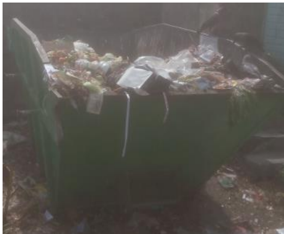
Fig 3. Large waste carrying system.