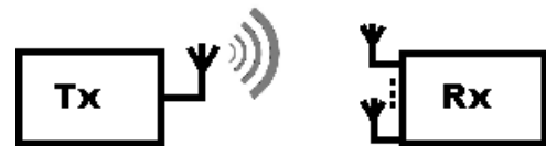
Fig 2. Single input multiple output

The SIMO or Single Input Multiple Output version of MIMO occurs where the transmitter has a single antenna and the receiver has multiple antennas. This is also known as receive diversity.