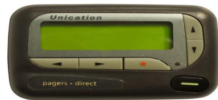
Fig 6. Pager