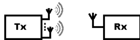
Fig 3. Multiple input single output

MISO is also termed transmit diversity. In this case, the same data is transmitted redundantly from the two transmitter antennas. The receiver is then able to receive the optimum signal.