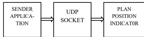
Fig 1. Block Diagram

In this application, we simulate different position of the ship using the initial range and bearing values. It is used to read the range and bearing of the target ship. The accepted value is in the form of polar co-ordinates. To place the image in the PPI display system, the range must be converted to system's range in pixel. This will place the target in PPI in its accurate position from the ship. The conversion of polar to pixel can be performed using the following formula.